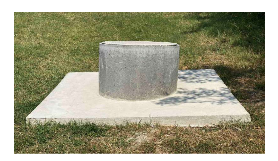
This is the situation at our first visit and after we assisted with our project, now he has water inside the house and water for his crops.

His request to WFLK was to assist him in paving and isolating the well with cement and reinforcement, and then in installing pipes, cable and an electric pump to bring water inside their house. This project was finished successfully and they are thankful for this great help. As a result seven people have safe drinking water now.