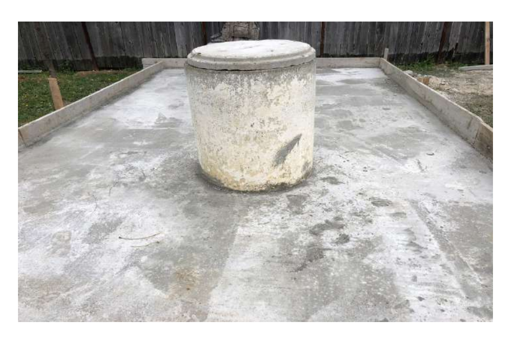
This is the situation at our first visit and after we assisted with our project, now he has water inside the house and water for his crops.

His well was unprotected from the rain, trash, sewage and other possibilities to be polluted. He requested to put a cement ring with the lid, to pave and isolate the well with cement and reinforcement, and installpipe, cable and an electric pump to bring water inside their house. Now, this project is completed, they are thankful for this great help and as a result 7 people have better and safe drinking water.