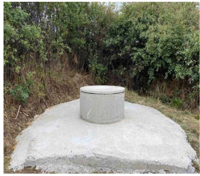
The condition of the well when we first visited and after the work was done. This well now is protected from pollution and water is much safer to be used.