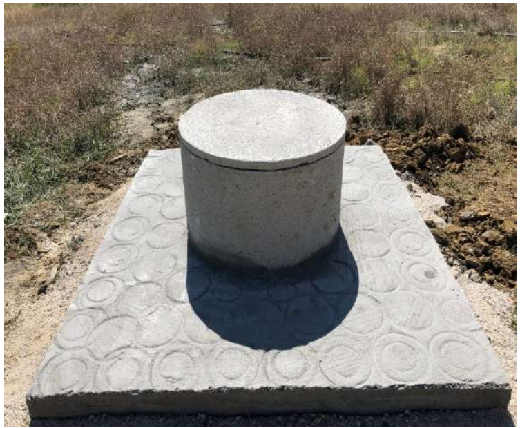
Intervention in the infrastructure to protect the well from pollution.