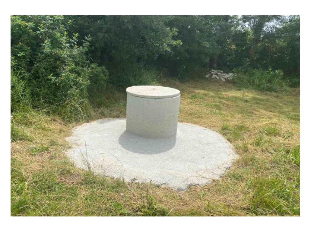
The condition of the well when we first visited and after the work was done. This well now is protected from pollution and water is much safer to be used.

His well was unprotected from the rain, trash, sewage and other possibilities to be polluted. He requested to put a cement ring with the lid, to pave and isolate the well with cement and reinforcement, and installpipe, cable and an electric pump to bring water inside their house. Now, this project is completed, they are thankful to Water for Life Kosovo and as a result 4 people have better and safe drinking water.