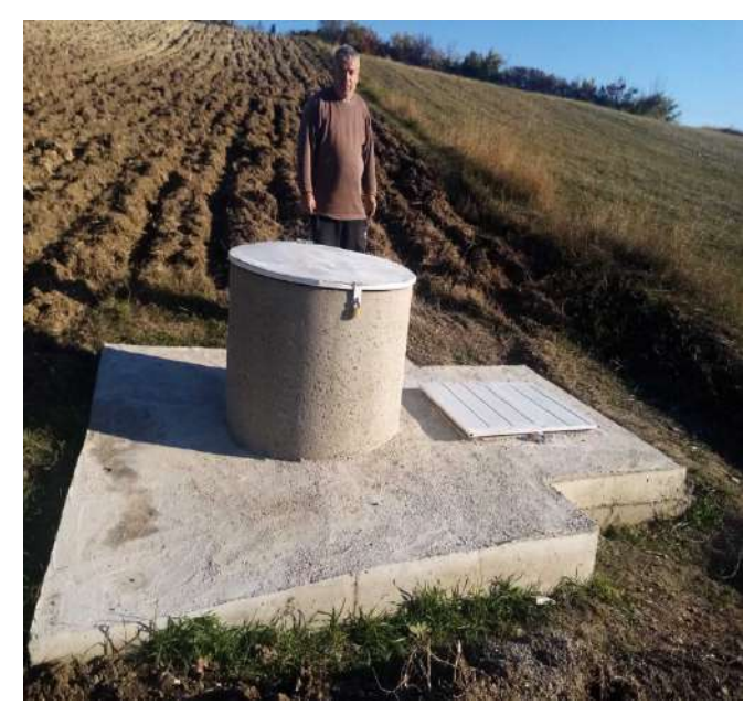
Before, during the work and after the project is completed.