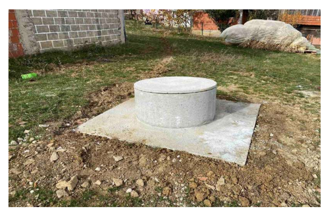
Intervention in the infrastructure to protect the well from pollution.

His well was unprotected from the rain, trash, sewage and other possibilities to be polluted. He requested to put a cement ring with the lid, to pave and isolate the well with cement and reinforcement, and installpipe, cable and an electric pump to bring water inside their house. Now, this project is completed, they are thankful to Water for Life Kosovo and as a result 5 people have better and safe drinking water.