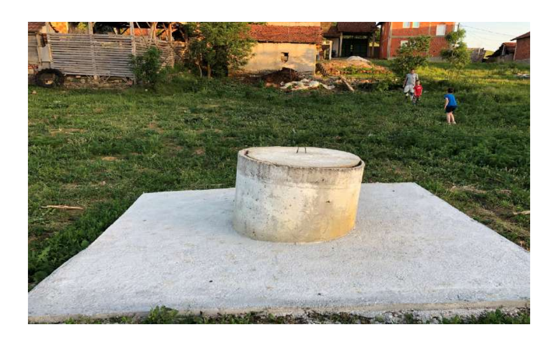
The condition of the well when we first visited and after the work was done. This well now is protected from pollution and water is much safer to be used.

Water situation, his well was unprotected from the rain, trash, sewage and other possibilities for pollution. His request was to pave and isolate the well with cement and reinforcement, after that to install pipe, cable and an electric pump to bring water inside their house. Now, this project is completed, he and his family have plenty of safe water for their basic needs. They are very thankful to Water for Life Kosovo and the people who donated for this project. As a result 5 people five access to safe drinking water.