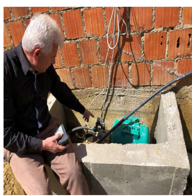
The condition of the well when we first visited and after the work was done. This well now is protected from pollution and water is much safer to be used.