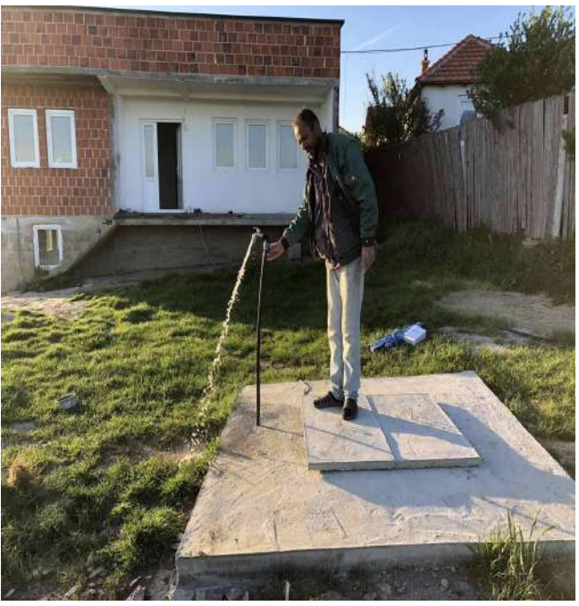
This is the situation at our first visit and after we assisted with our project, now he has water inside the house and water for his crops.